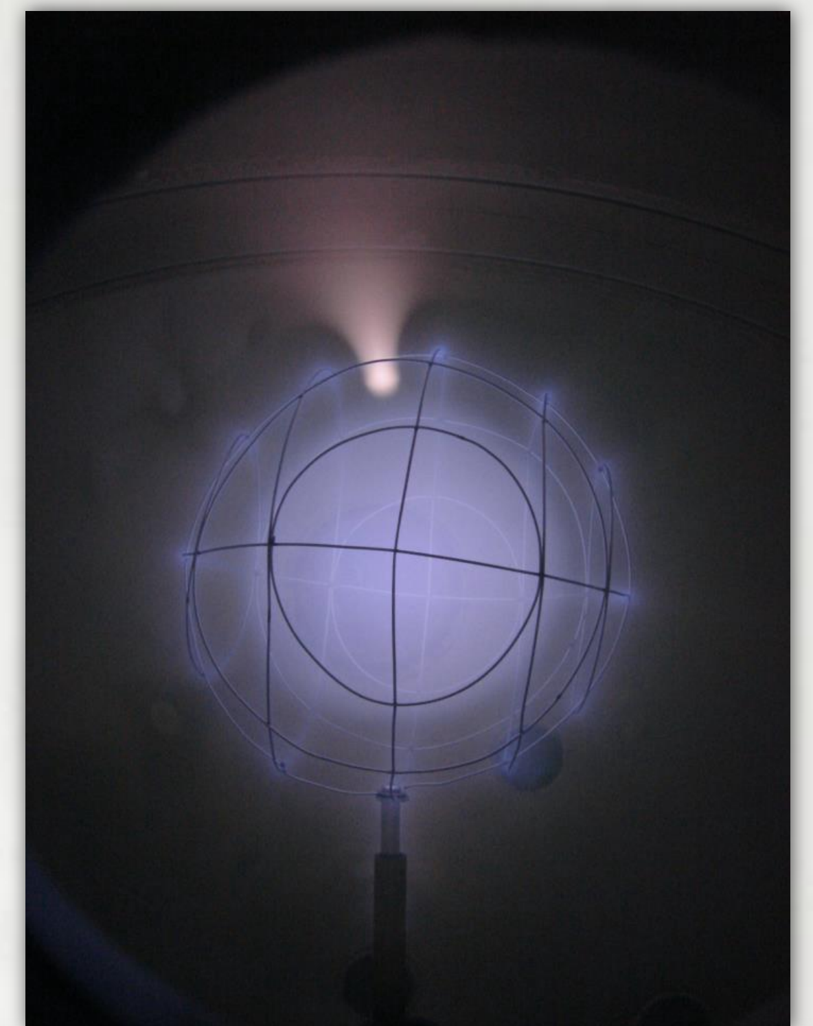
IEC Reactor, Argon, 2kV and 50mA Inner electrode through viewport MSFC ER-24

The IEC Diffusion Thruster is based on the IEC device, a fusion reactor concept. IEC design incorporates radial acceleration of ionized particles to a central point where recombination is visible. Neutrons can be measured when operating the reactor with Deuterium. Operating with neutron emission requires restricted access to prevent overexposure. The device also shows visible results by using Argon, however there are no neutrons.